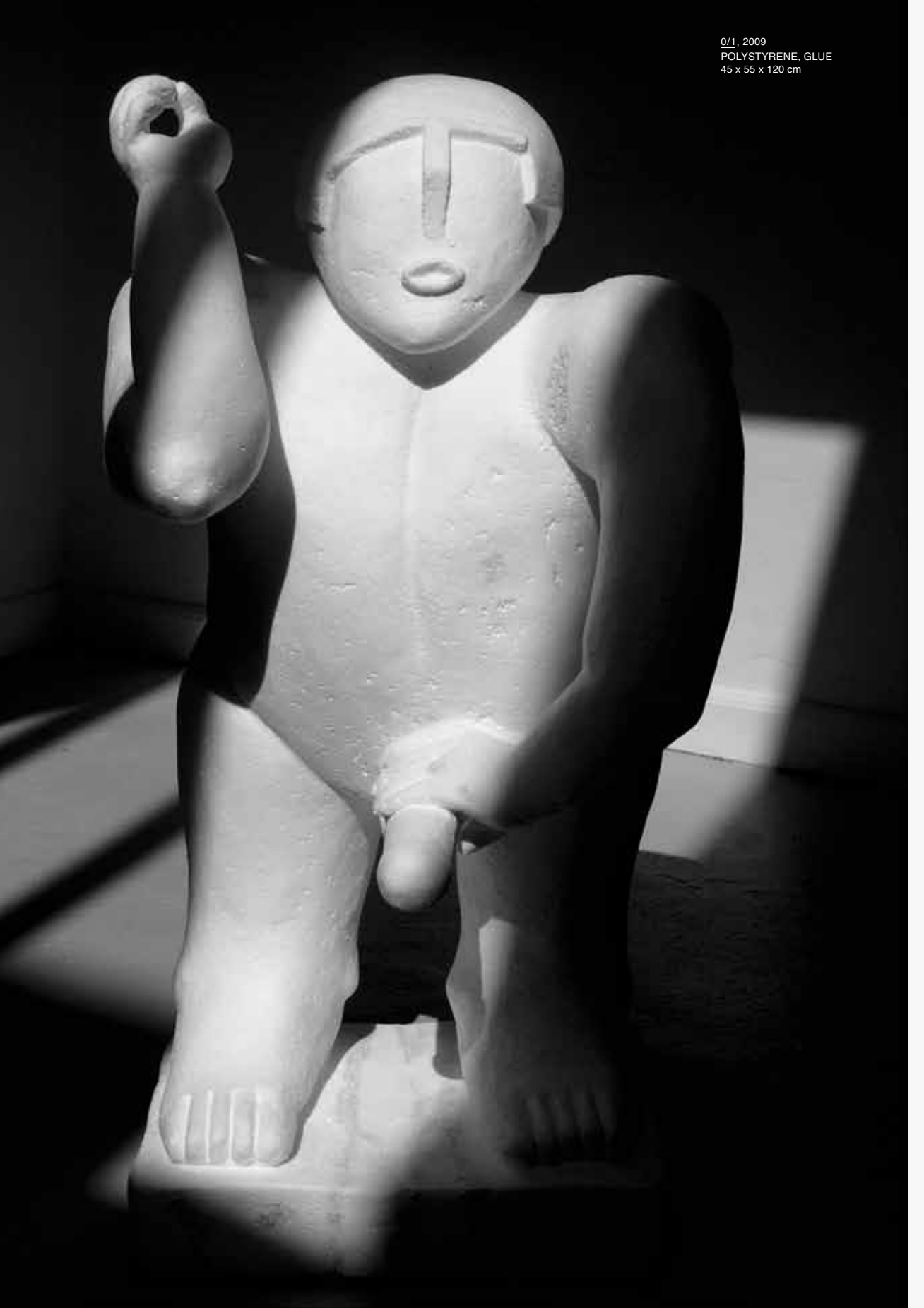
OBJET TROUVÈ, 2008

"AFRICAN SCULPTURE", IPOD SHUFFLE, HEADPHONES CABARET VOLTAIRE: BAADER MEINHOF / SEX IN SECRET ON A FACTORY PLANT