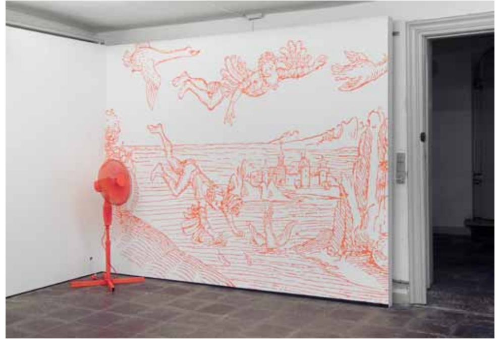
PLAYBOY OF THE WESTERN WORLD, 2009 (AFTER THE ICAROS WOODCUT BY ALBECHT DÜRER) ROTATING ELECTRIC FAN, FLUORESCENT ACRYLIC PAINT VARIABLE DIMENSIONS