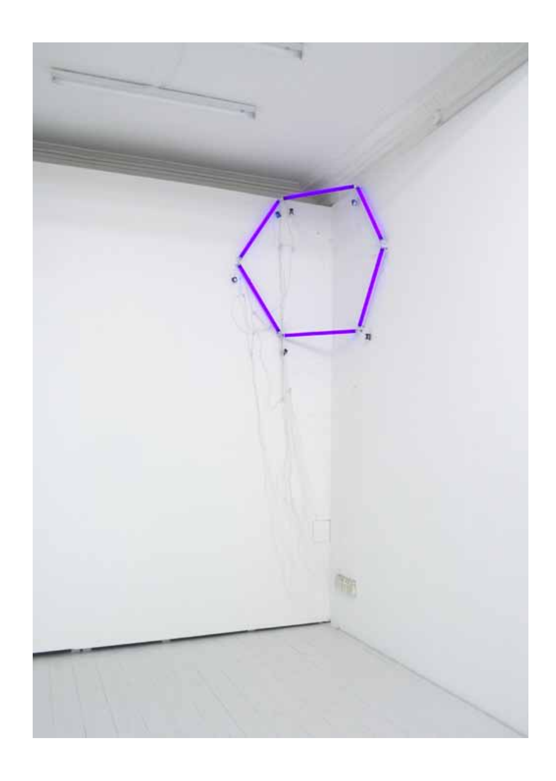
NEW DAWN FADES, 2010 UV LIGHT TUBES ("BLACKLIGHT"), WIRE, FITTINGS VARIABLE DIMENSIONS